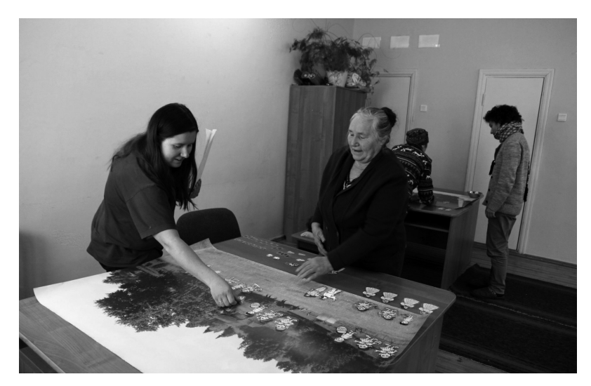
Figure 1. The experimental setting

The experiments were designed according to principles of referential communication tasks method. This method was suggested by Krauss and Weinheimer (1966). It is widely used during experiments with children (O'Neill 1996, Pan and Snow 1999, Girbau 2001) and with deaf people (Zajceva 2000), in teaching foreign languages (Yule 1997), study of syntactic priming (Judina and Fedorova 2009). During referential communication experiments the linguist records the dialogue between speakers who communicate by the phone or through a non-transparent screen. One of the speakers, the Director, receives certain information which they should verbally transfer to their addressee, the Matcher. Fig. 1 shows the setting of one of our experiments.