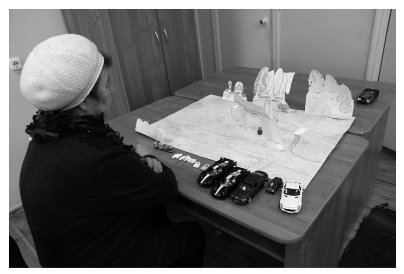
Figure 3. The setting of the 3-dimensional "maze" experiment

wooden puppets and five cars), partly hand-made of play-dough (two bags, three loafs of bread, three boxes of sugar). Fig. 3 shows one of the participants with a model of Shamardan area and with all figures used during the "maze" type of experiments: